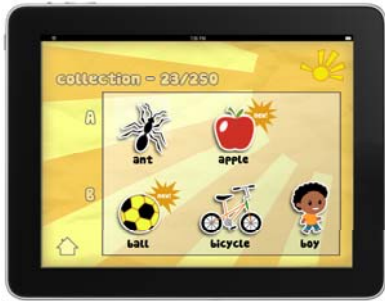
Figure 7: Object collection screen for review and practice.