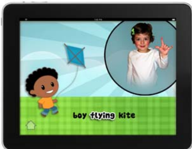
Figure 6: Animation of interaction with signed phrase.

Regardless of age, children differ in their cognitive and linguistic abilities. For instance, 2-year-old children have more limited vocabulary than older children and are commonly limited to expression through very short phrases and sentences. However, infants are also more attentive to objects in their environment [3,6]. SignBright will initially address early language learning through presentation of simple objects in correlation with text (Fig. 4). These objects are selected based on relevance to a particular age. Parents can interact with the elements via the SignFinder tool, which will present them with video of related signed gestures. In this way, parents and children can begin to build a vocabulary that allows them to communicate freely and understand each other's needs.