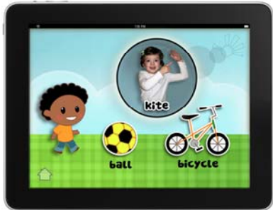
Figure 5: User views/selects objects using SignFinder tool.