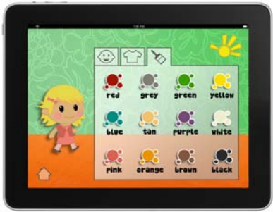
Figure 2: Avatar customization.