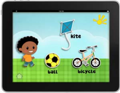
Figure 4: Storytelling interface. User presented with objects.