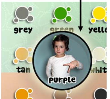
Figure 3: Color identification / selection using SignFinder tool.

American Sign Language (ASL) and Signed English (SE) forms of sign language [11,12].